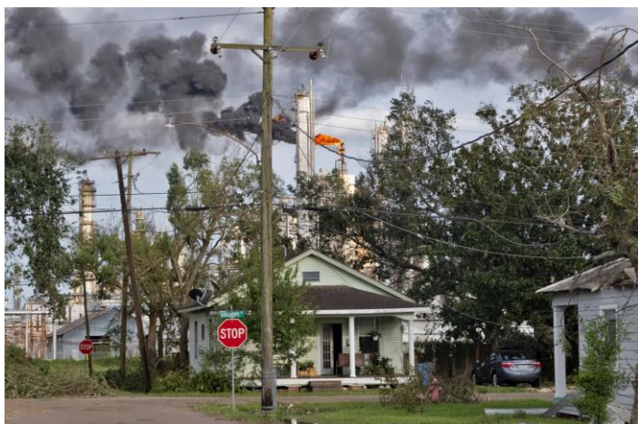
House near an oil and chemical complex in Norco, Louisiana, the day after Hurricane Ida hit.